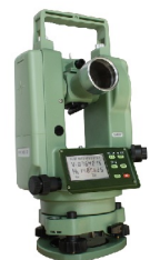
DT202C-Z Auto-collimating theodolite